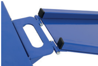
POS. 1 Mount the ramp 2x M6 hex bolts