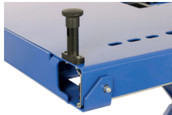
POS. 2 Mount the rateriner knob 2x M5 hex bolts