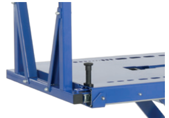
POS. 4 Push the clamping frame completely in