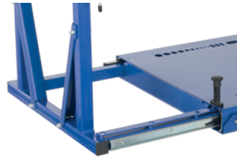
POS. 3 Insert clamping frame in guide rail